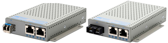
SFPs not included

*See the Model Comparison table on page 5 for the comparison of the previous/old and the enhanced models.