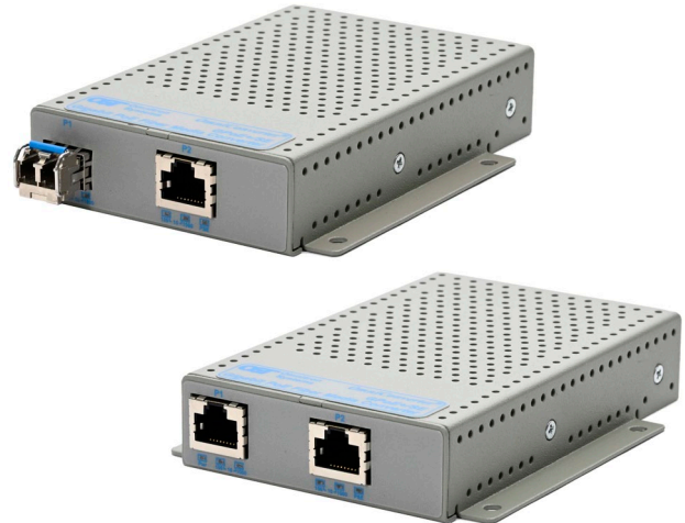
SFPs not included

*See the Model Comparison table on page 4 for the comparison of the previous/old and the enhanced models.